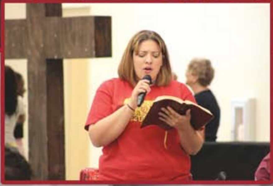
Above, right: Morning Bible study and late-night vespers began and ended each day with life-changing truth.