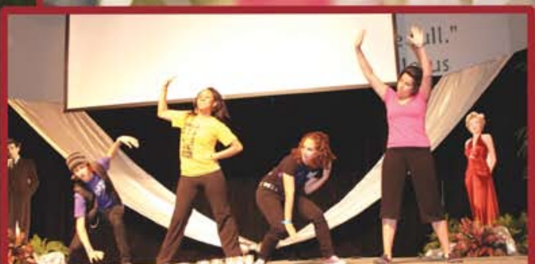
Left, fluorescent clothing depicts 80s night, and below, a group performs during the Old Hollywood talent show.