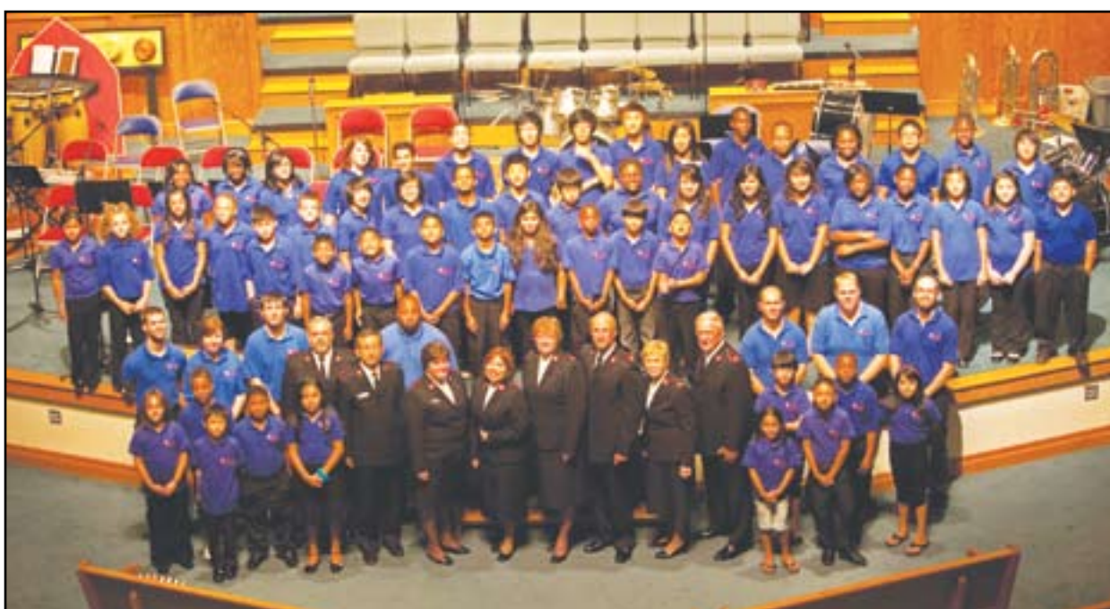
Graduates of the 2009 Jack T. Waters Music Conservatory are shown with officers and staff.

Students from the program excel in other arenas of Army music. The academy has a strong contingent of members in the Carolina Youth Band and over the past two years recipients of the Hall Band Award at the Territorial Music Institute have been from the conservatory program.